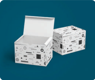
Paper converting products