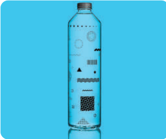
Screen printing products