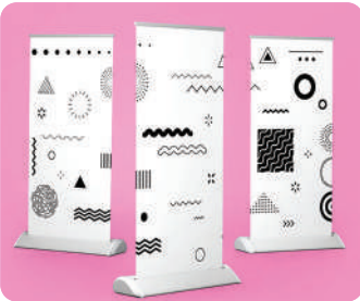
Large format products